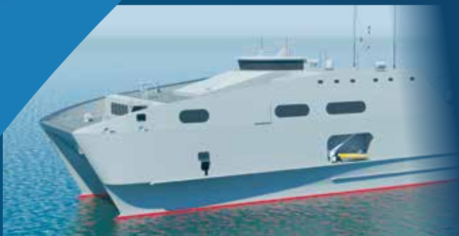
▲ SELF-DEFENCE CAPABLE HSSV

The High Speed Support Vessel (HSSV) is a multi-mission capable patrol or special operations solution based on Austal's proven high speed catamaran platform. The shallow draft, medium-lift-aviation vessel offers high speed performance and manoeuvrability, outstanding payload capacity for vehicles, equipment, troops and stores. With a helicopter platform, multi-deck hoist, stern ramp and crane, the HSSV is prepared for any military, SAR or humanitarian / disaster relief mission.