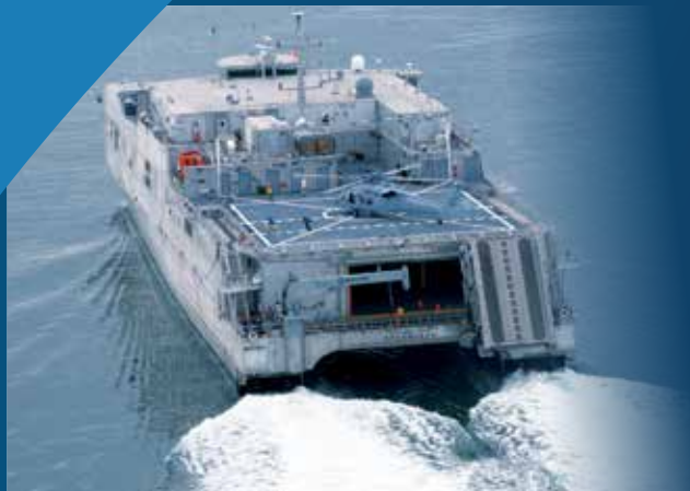
▲ EPF FEATURES MEDIUM LIFT AVIATION CAPABILITY.

The EPF (Expeditionary Fast Transport) formerly the JHSV (Joint High Speed Vessel) is a new generation, multi-use platform capable of transporting troops and their equipment, supporting humanitarian relief efforts, the ability to operate in shallow waters, and can reach speed in excess of 35 knots fully loaded. The project brings together United States Navy, Army, Marines, and Special Operations Command to pursue a multi-use platform.