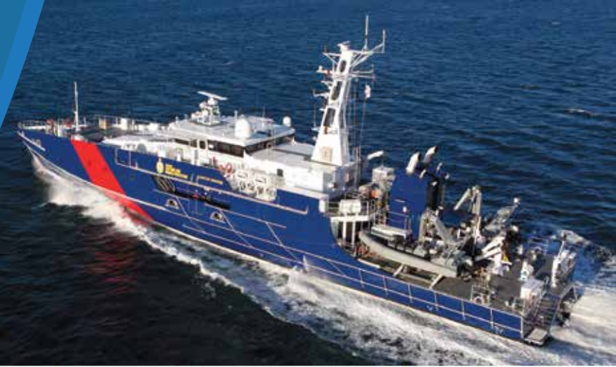
▲ CAPE CLASS PATROL BOAT

Austal is the world's leading supplier of high performance aluminium vessels for the defence sector. With its unrivalled in-house design resource and powerful production capacity, Austal provides fast delivery of naval, patrol and auxiliary platforms which address unique customer requirements.