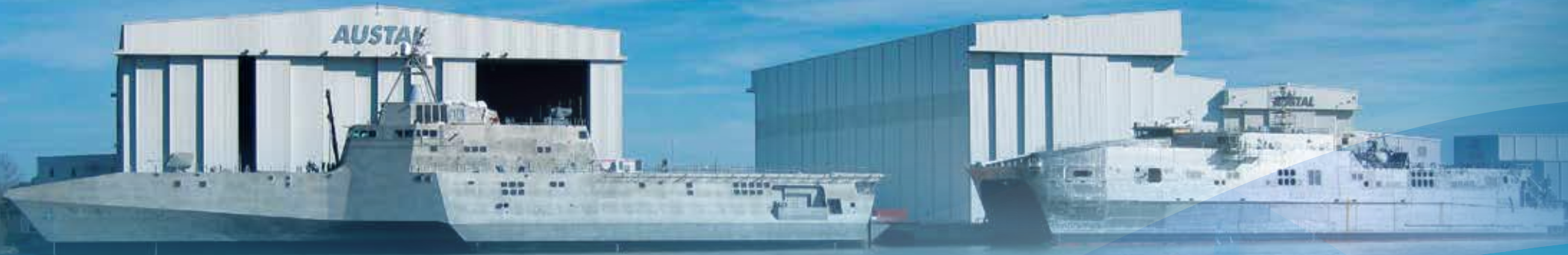
MOBILE, ALABAMA, USA