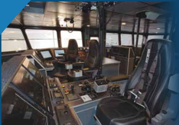
▲ CAPE ST GEORGE BRIDGE

The Cape Class Patrol Boats are designed to accommodate future upgrades in weapons systems, surveillance technology and response capability.